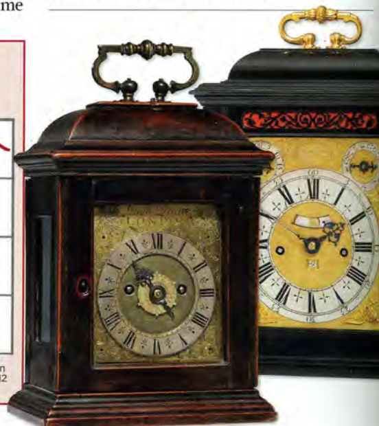
CHRISTIE'S IMAGES LTD 2013