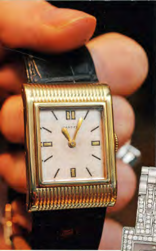
Above: a rare 18ct Cartier gold watch owned by Sir Cecil Beaton auctioned by Bonhams in 2010. Right: this white-gold Patek Philippe wristwatch fetched £8,125 at Christie's