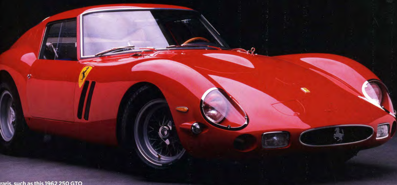
Ferraris, such as this 1962 250 GTO and 1960 250 GTO (below, at Goodwood), lead the classic car market

Guns aren't liable for Capital Gains Tax but armour is. Godfrey Barker unravels the mysteries of wasting assets